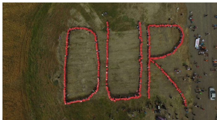
'DUR' – 'STOP' in Turkish – marked out by coal protestors next to a coal ash dam in Aliğa during last May's Break Free action